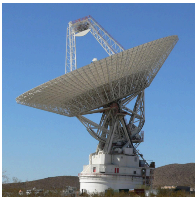
Figure 19.3 Radar Telescope. This dish-shaped antenna, part of the NASA Deep Space Network in California's Mojave Desert, is 70 meters wide. Nicknamed the "Mars antenna," this radar telescope can send and receive radar waves, and thus measure the distances to planets, satellites, and asteroids.

From the various (related) solar system distances, astronomers selected the average distance from Earth to the Sun as our standard "measuring stick" within the solar system. When Earth and the Sun are closest, they are about 147.1 million kilometers apart; when Earth and the Sun are farthest, they are about 152.1 million kilometers apart. The average of these two distances is called the astronomical unit (AU). We then express all the other distances in the solar system in terms of the AU. Years of painstaking analyses of radar measurements have led to a determination of the length of the AU to a precision of about one part in a billion. The length of 1 AU can be expressed in light travel time as 499.004854 light-seconds, or about 8.3 light-minutes. If we use the definition of the meter given previously, this is equivalent to 1 \text{ AU} = 149,597,870,700 \text{ meters} .